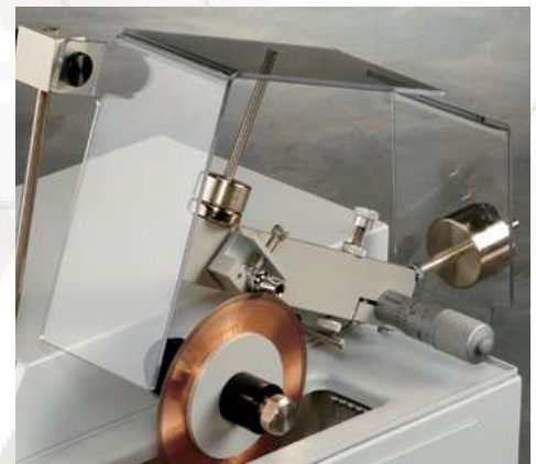
The optional Splash Guard Kit (11-1199) prevents coolant from spraying.