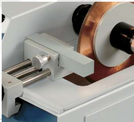
The optional dressing chuck (11-1196) allows dressing of the wafering blade without interrupting the sectioning process.