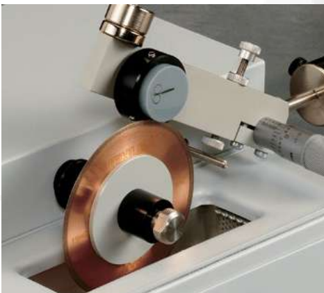
Mounted samples can be sectioned effectively with proper selection of chucks and flanges.

The IsoMet Low Speed accepts a wide variety of HC, LC, and CBN blades in 3in, 4in, and 5in sizes. See Buehler's offering for blades.